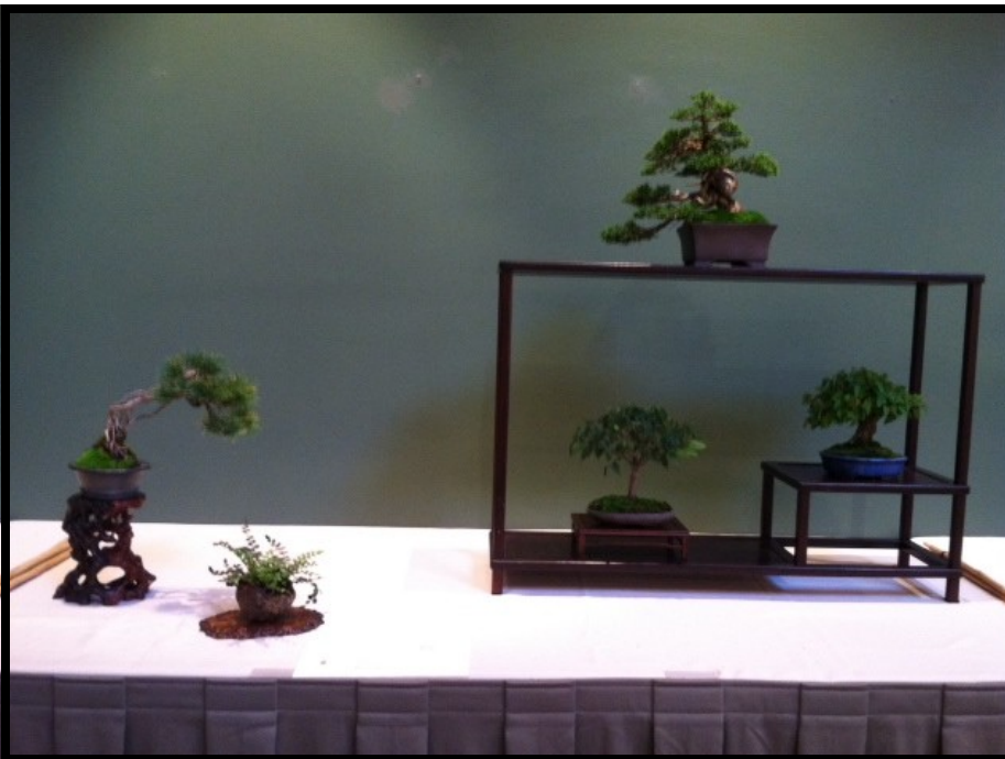
Mark Fields' 5 Point Composition

Don't Forget! The IBC Annual "Members Only" Auction—September 3, 2014. It's going to be FUN!!!!