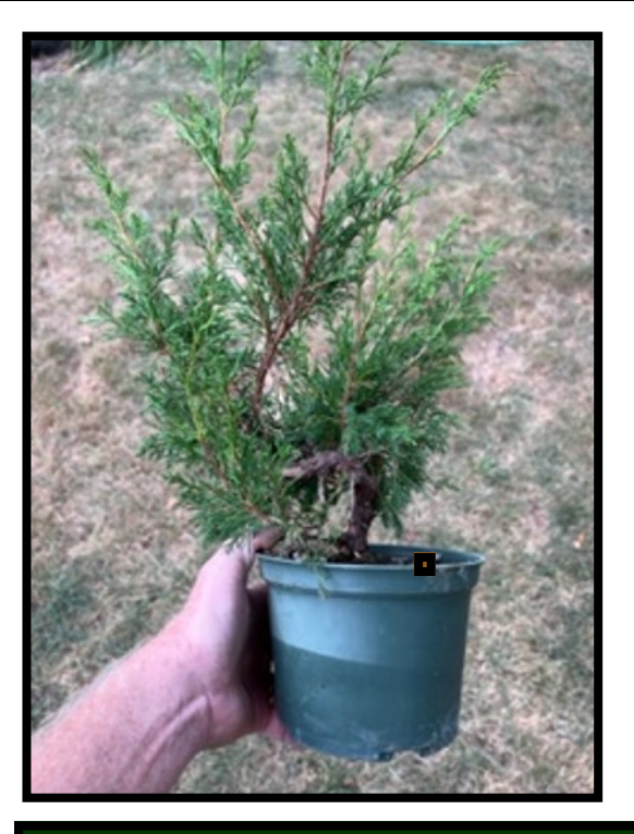
Above is a sample of the $80 Juniper to be available for the October Conifer Workshop.