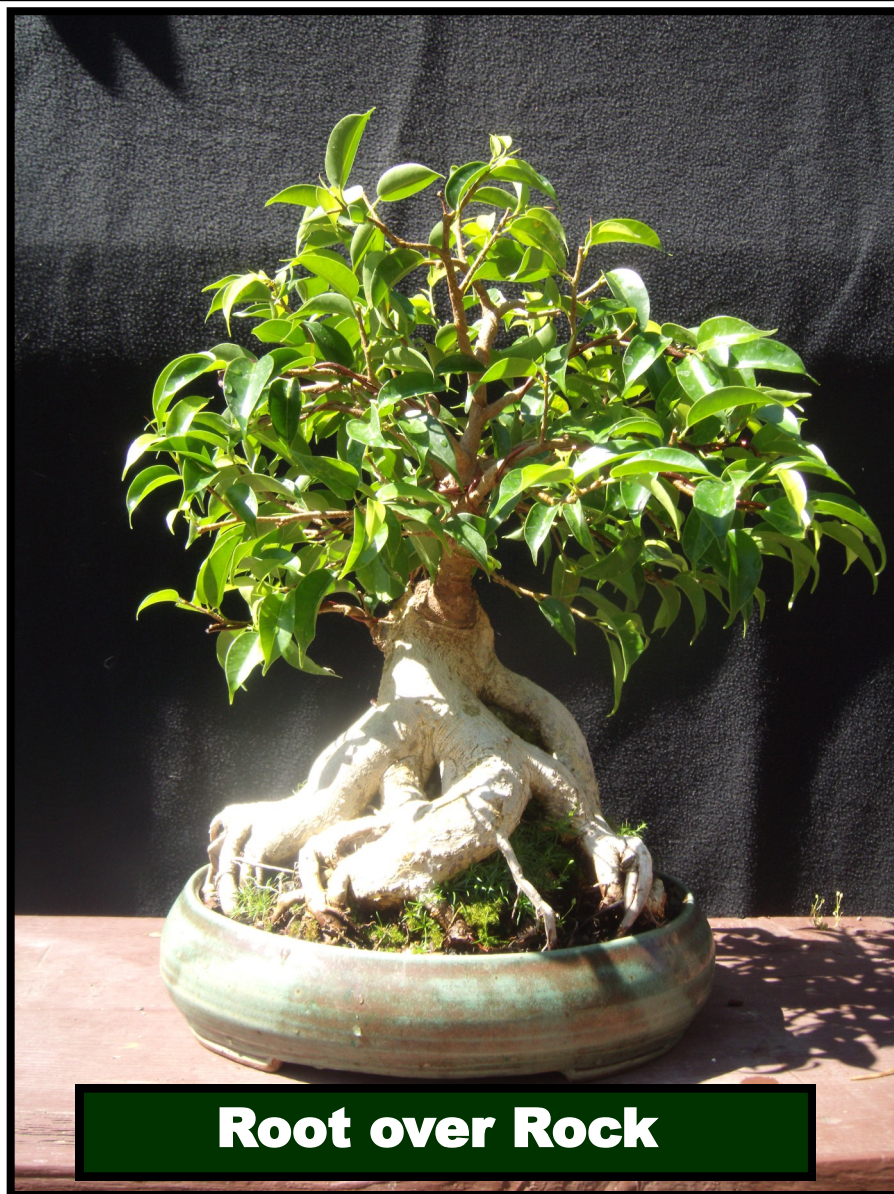
Root over Rock