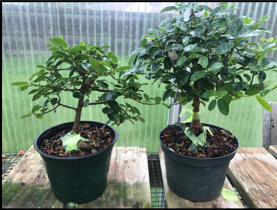
Burret Davyi Ficus over rock ( an ex- ample of po- tential June work- shop efforts )