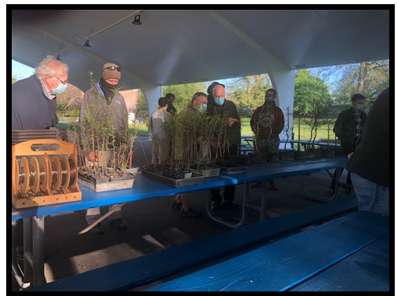
Bald Cypress Workshop