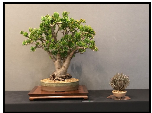
My Coral Jade