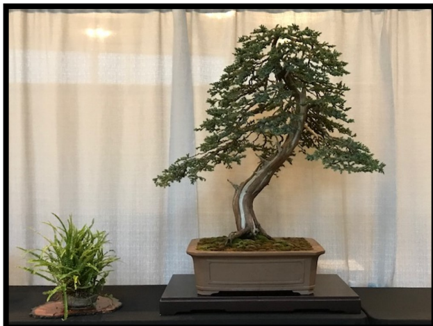
My Blue Alps Juniper