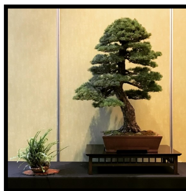
My Kokonoe Japanese