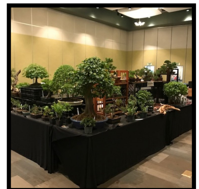
Bonsai by Fields Booth