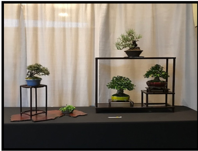
My 5 point composition