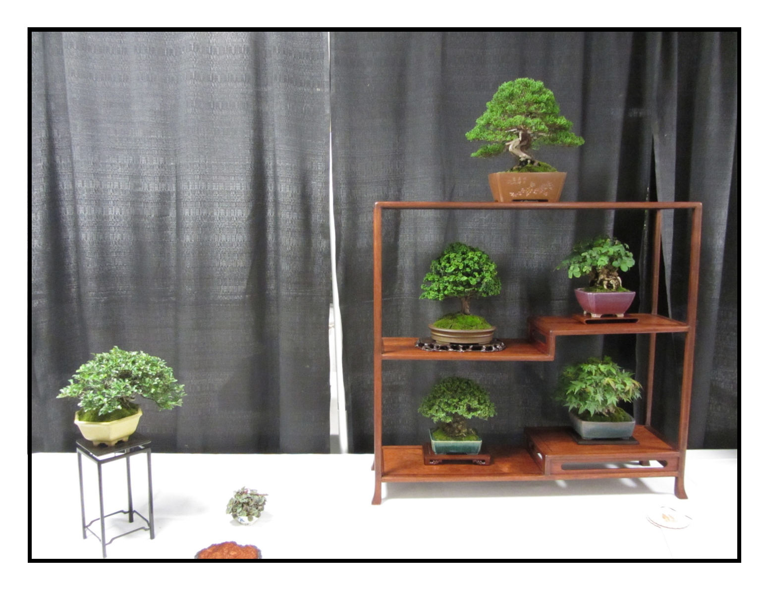
Best Shohin Display: Neil Dellinger