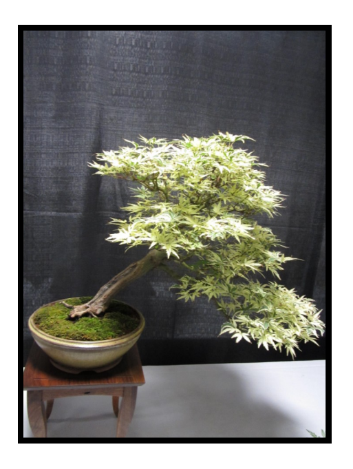
Japanese Maple "Butterfly" Bob Warfel