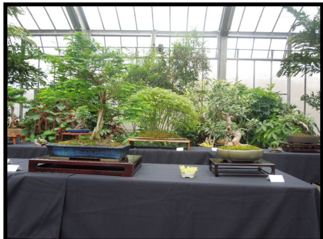
More of the Garfield Park Exhibit 2016