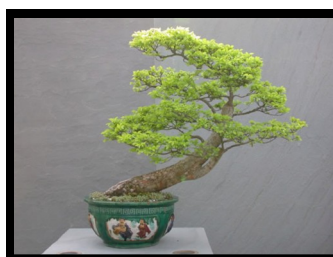
Ulmus Parvifolia|Chinese Elm