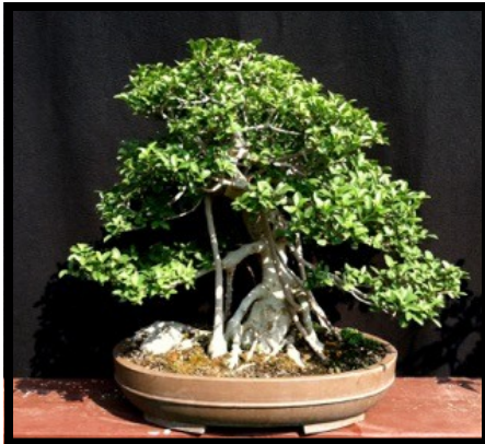
This Burt Davy ficus lost almost no leaves this winter. It was defoliated this past summer.