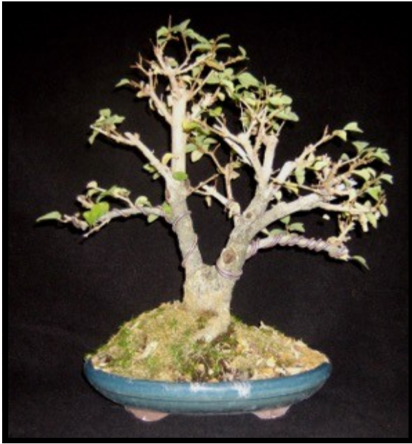
This Parrot's Beak loses almost all it's leaves every year in mid to late winter.