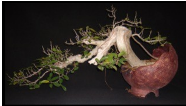
Eight years ago, this tree was the conjoined twin of the first Burt Davy Ficus. They are genetically identical. This tree was defoliated in 2013, but not in 2014. It lost almost all of it's leaves this winter.