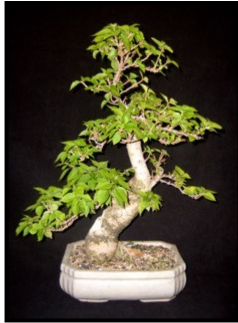
This bougainvillea lost almost all of it's leaves in early winter. It is now filled with young, fresh foliage.